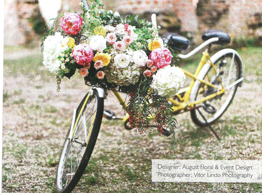
Designer: August Floral & Event Design

Nothing says romance like a bicycle built for two – especially if the handlebar is dripping with flowers. Kimberly Cheney , owner of August Floral & Event Design in Savannah, Ga., designed a lush arrangement of blooms in floral foam covered with chicken wire, which was secured to the top of the bicycle basket with cable ties to ensure a picture-perfect ride.