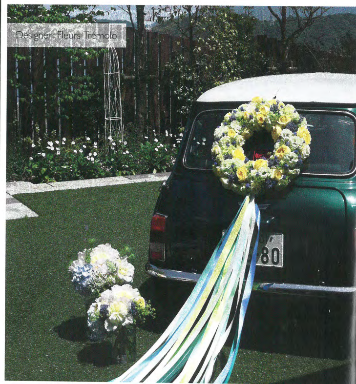
Designer: Fleurs Trémolo

In keeping with his fashion-forward design aesthetic, Hiroshima, Japan-based designer Yukinobu Fujino of Fleurs Trémolo pushed the traditional getaway car wreath in a new direction by adding long, trailing ribbons and having the wreath appear to float on the rear window of a Classic MINI Cooper. Yukinobu covered the floral-foam wreath with roses, Eustoma and Muscari before suspending it with transparent nylon threads anchored to the front bumper to achieve the floating illusion.