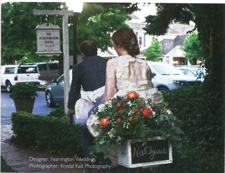
Designer: Ferrington Weddings

Mary Stevens takes cues from her pastoral surroundings while creating innovative floral designs at Ferrington Village in Pittsboro, N.C. In keeping with the outdoor wedding romance vibe, she outfitted a tandem bike with a crate of flowers attached to the rear bicycle rack. The bicycle graced the ceremony entrance at a Ferrington garden wedding with a sign that read “Nearlyweds.” After the ceremony, the newly married couple rode the bike – with a sign that read “Newlyweds” – down a ramp into the reception barn, much to the delight of their guests. ■