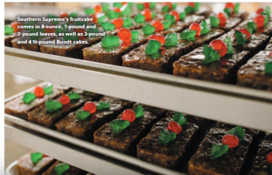
Southern Supreme's fruitcake comes in 8-ounce, 1-pound and 2-pound loaves, as well as 3-pound and 4 1/2-pound Bundt cakes.

Where does the fruit come from? Most of the fruits that are in the fruitcake come from Florida. The rest of the items are sourced locally. ▶