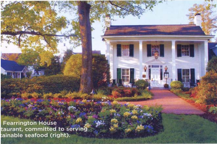
Ferrington House restaurant, committed to serving sustainable seafood (right).